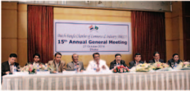
DBCCI 15th AGM