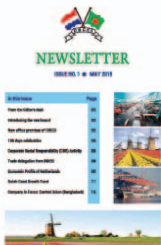
Re-launched 1st News Letter 2014-16