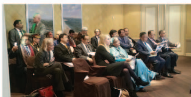
Honorable Prime Minister Sheikh Hasina in a Seminar on Delta Plan in Kurhaus Hotel on 04 November 2015

A high profile team from Dutch-Bangla Chamber of Commerce and Industry (DBCCI) partook in the Bangladesh Business Delegation to the Netherlands as entourage of Honorable Prime Minister of Bangladesh Sheikh Hasina during November 3-5, 2015.