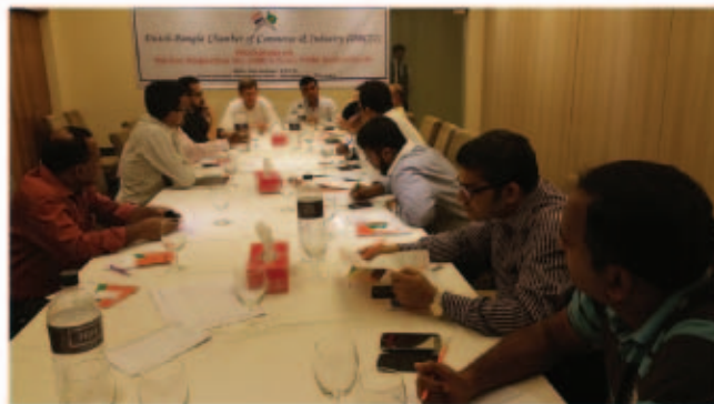
Workshop on Senior Expertise Support for SMEs from PUM Netherlands on 6 October 2015

A workshop was held on "Senior Expertise Support for SMEs from PUM Netherlands" on Tuesday the 6th October, 2015, at 6pm at Gardenia Restaurant, House-NW(1)-8, Road-51, Gulshan-2, Dhaka. As a PUM representative in Bangladesh Dutch-Bangla Chamber of Commerce & Industry (DBCCI) organized the seminar for its distinguished members.