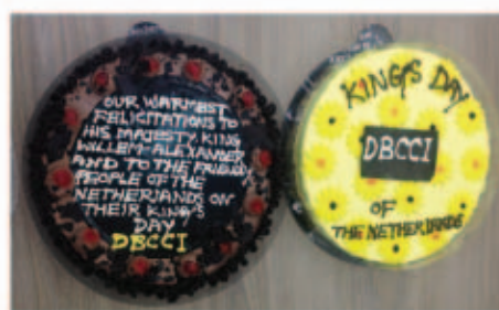
Kings Days Celebration Cake in the DBCCI Board Meeting on 27 April 2015

The Board of Directors celebrated the King's Day in the DBCCI Board Meeting on 27 April 2015. The Board members expressed their felicitation to His Majesty King Willem Alexander and the friendly people of the Kingdom of the Netherlands in a cake festival.