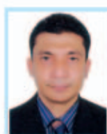
Joint Secretary General

Managing Director & CEO Biswas Tradelink Corporation Ltd. (Power & Water Sector) Palanners Tower, Suite: 7-8, Lenel-14, 13/A, Sonargaon Road, Dhaka Tel : +88 02 9666631 Cell : +88 01711561862 E-mail : md@btgroupbd.com Website : www.btgroupbd.com