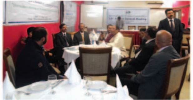
Participants of 14th AGM of DBCCI on February 1, 2014

The 14th Annual General Meeting (AGM) of the Dutch-Bangla Chamber of Commerce and Industry (DBCCI) held on Saturday, the 1st February 2014 at 7:00 pm at Flambe Restaurant, House # 6, Road # 50, Gulshan 2, Dhaka. 24 distinguished members of DBCCI were present in the AGM.