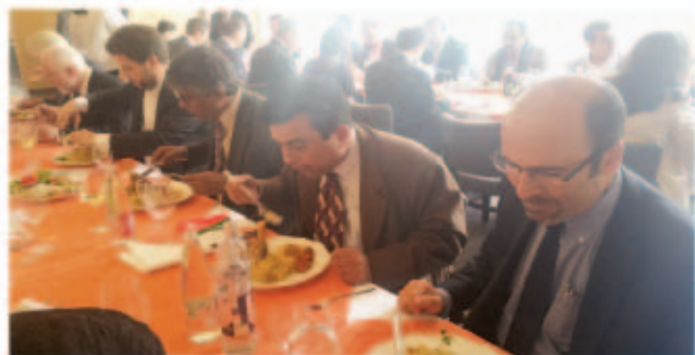
Lunch at Orchidee Restaurant in the honor to DBCCI Delegation hosted by the President of BBCCL Luxembourg