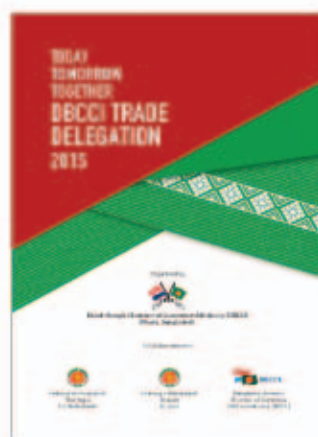
DBCCI Trade Delegation Souvenir Brochure