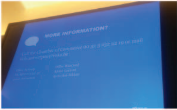
Presentation in DBCCI Business Seminar in VOKA (Chamber of Commerce & Industry) Antwerp in Belgium on 8 September 2015