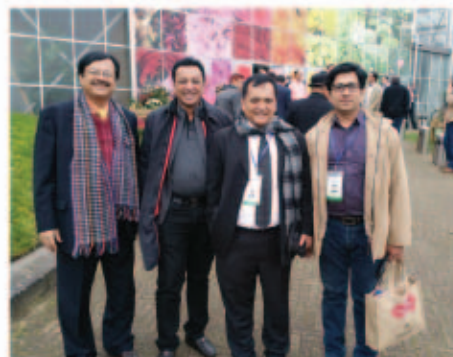
Visited Flower Show in the Netherlands on 04 November 2015