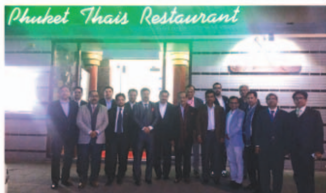
Group Photo in the Dinner hosted by Honorable Foreign Secretary of Bangladesh in the Hague