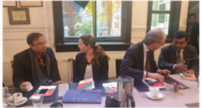
B2B Meeting in VOKA (Chamber of Commerce & Industry) -Antwerp in Belgium on 8 September 2015