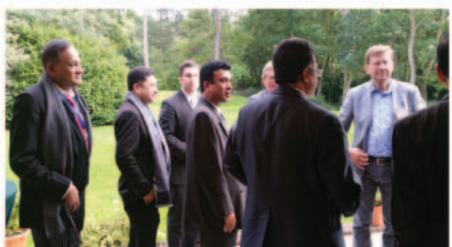
DBCCI Delegation in the Ambassador's Residence Bangladesh House in the dinner reception