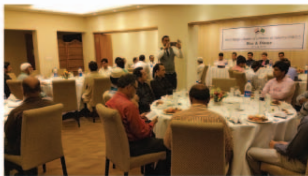
Participants of DBCCI Iftar Party on 6 July 2015