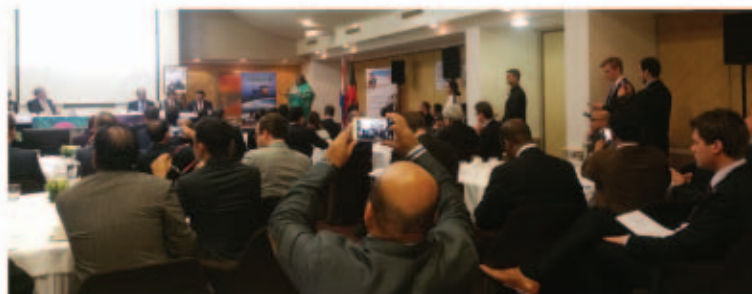
H. E. Sheikh Hasina, Honorable Prime Minister of Bangladesh delivering speech as a Chief Guest in the Business Seminar in the Netherlands on 5-Nov-2015

On November 4, 2015 a presentation and discussion on Netherlands Delta Plan and Bangladesh Delta Plan 2100 comparison between both the delta plans venue: Jan Toorop Room, Kurhaus Hotel. An Official Dinner was held in honor of Hon'ble Prime Minister hosted by H.E. Mr. Mark Rutte , Prime Minister of the Kingdom of the Netherlands at Catshuis.