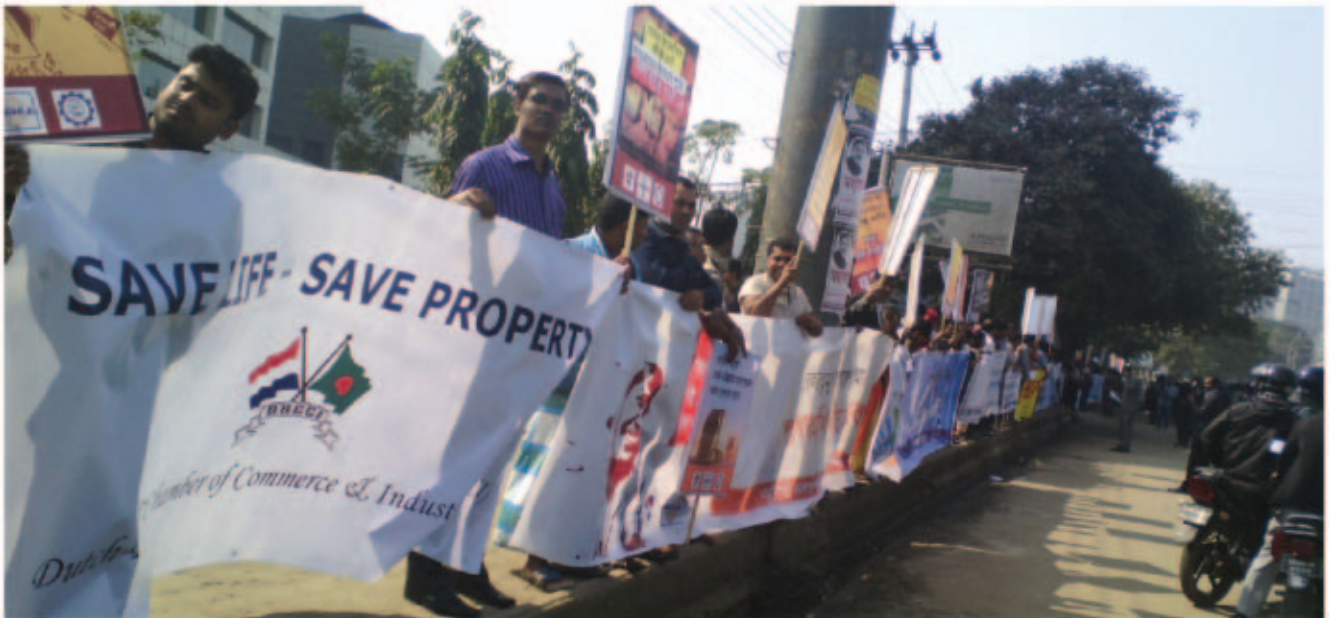
DBCCI participated the 'Human chain to create public awareness regarding current political situation' organized by BGMEA on January 28, 2015