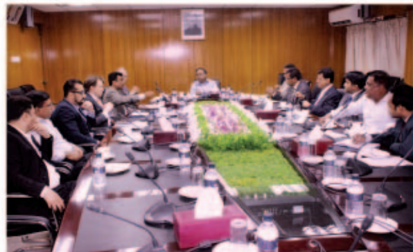
DBCCI Management Team Met Honorable Foreign Minister Mr. Abul Hassan Mahmood Ali, MP on 20 May 2015