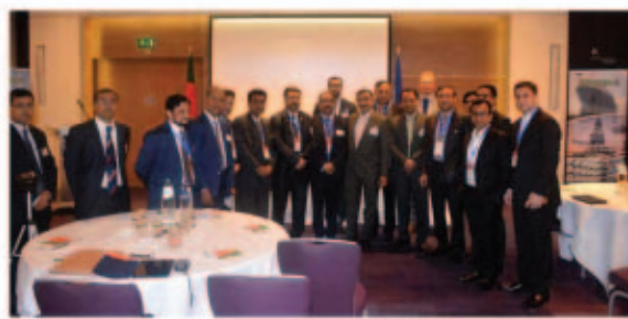
DBCCI Trade Delegation with HE Sheikh Mohammed Belal, Ambassador of Bangladesh Embassy Netherlands on 7 September 2015