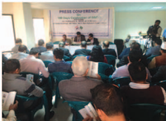
Press Conference & Doa Mahfil on 100 Days Celebration of DBCCI New Board 2014-16