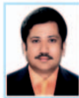
Vice - President

Managing Director Sakhi Lines Ltd. "ANZ Spring Field" Unit - B-1, 231/Ka, Tejgoan Ind. Area, Dhaka-1208 Tel : +88 02 9896951 +88 01613-900228 E-mail : sakhilineslimited@gmail.com Website : www.sakhigroup.com