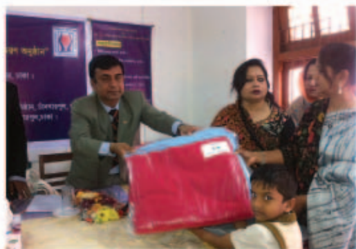
DBCCI Donated blankets for the poor patients of TB Control and Training Organization Wellbeing Association on January 31, 2015