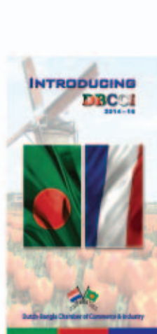
Profile of DBCCI