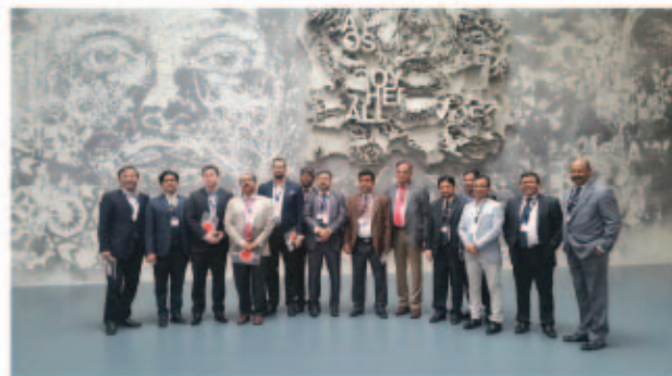
Visit Luxembourg Freeport which is a 50-million high security storage facility adjacent to Luxembourg Findel Airport