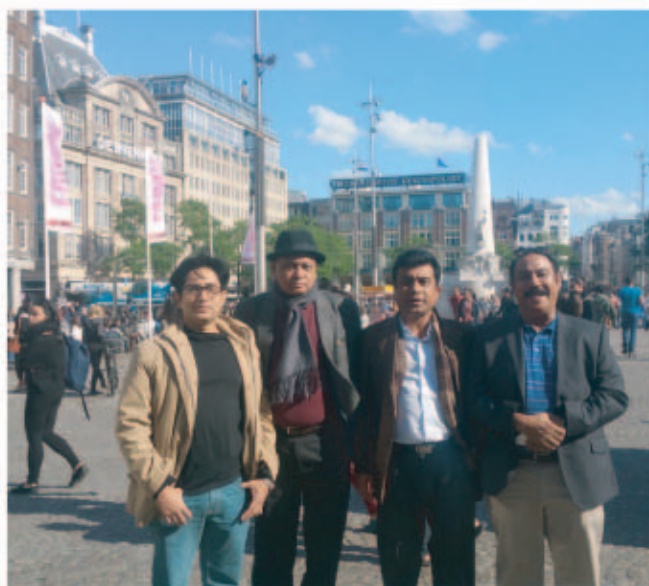
Sight Seeing in Amsterdam after the successful completion of the Trade Delegation on 10 September 2015