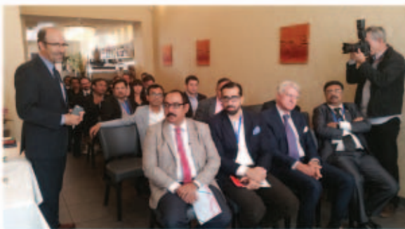
Part Participants in the Business Seminar in hosted by BBCCL Luxembourg