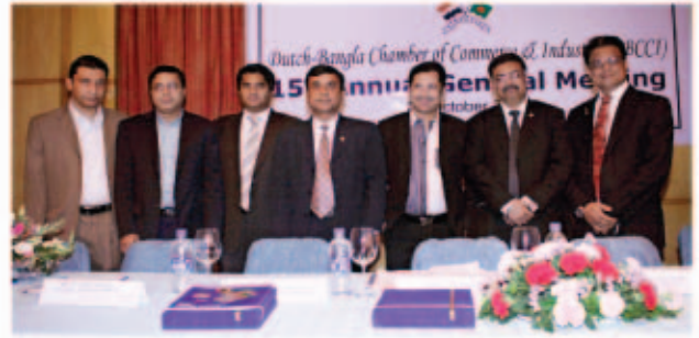
DBCCI New Board of Directors for the period of 2014-16