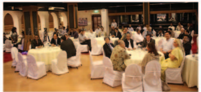
Participants in Seminar_ Bangladesh: Road to Recovery on 25 March 2015