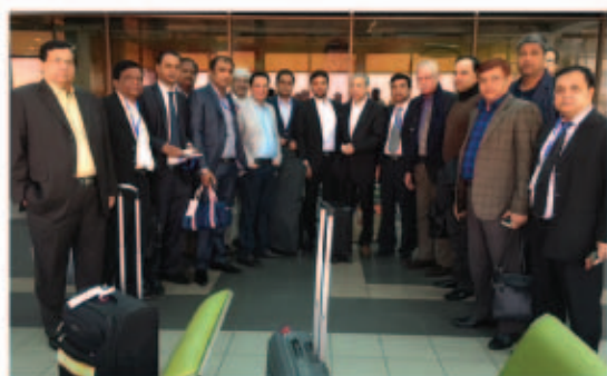
Business Delegation at the Dhaka Airport on 03 November 2015 as entourage of the Netherlands visit of the Honorable Prime Minister Sheikh Hasina