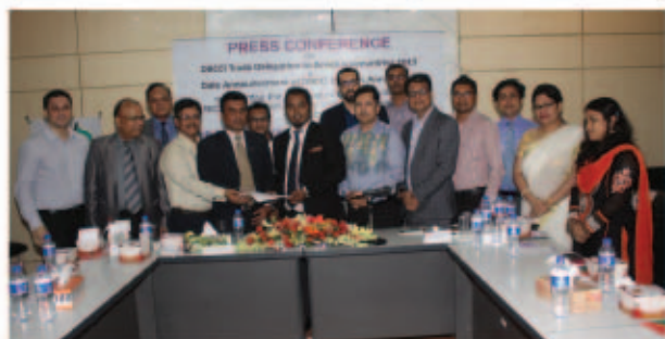
Group Photo of the Press Conference on DBCCI Trade Delegation to Benelux 2015 & Announcement of DBCCI 15 Years Anniversary on 29 August 2015