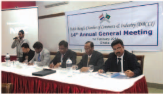
14th AGM of DBCCI on February 1, 2014