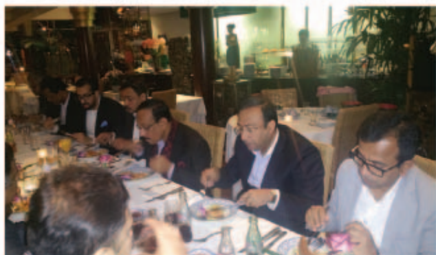
Dinner hosted by Honorable Foreign Secretary of Bangladesh in the Hague, on 9 September 2015