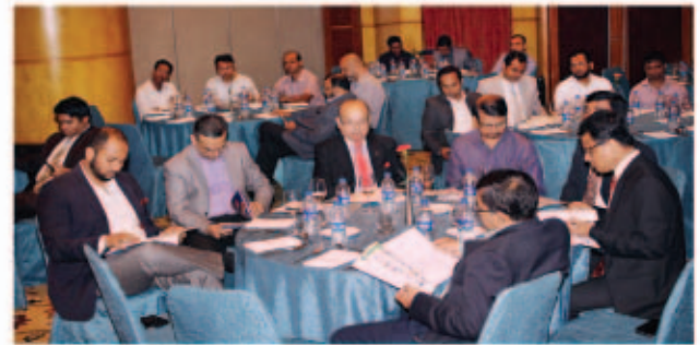
Participants of the DBCCI 15th AGM