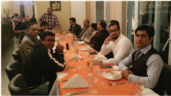
President of BBCCL Luxembourg hosted a Dinner Reception in the honor to DBCCI Trade Delegation on 8 September 2015