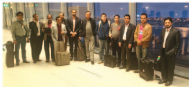
Officials of Bangladesh Embassy in the Netherlands received the DBCCI Trade Delegation on 6th September 2015 at Schiphol Airport in Amsterdam