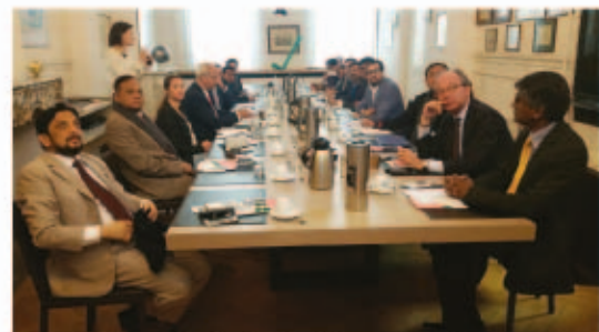
DBCCI Business Seminar in VOKA (Chamber of Commerce & Industry) -Antwerp in Belgium on 8 September 2015