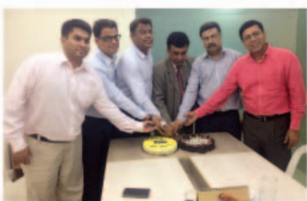
Kings Days Celebration in the DBCCI Board Meeting on 27 April 2015