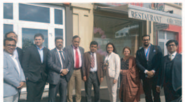
Delegation team In front of Orchidee Restaurant Luxembourg