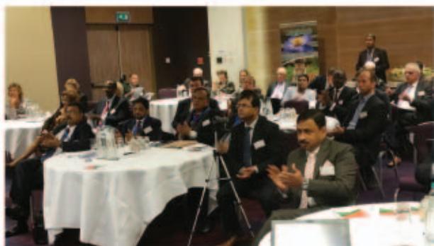
Part of the participants attended in the DBCCI Business Seminar in Hilton The Hague