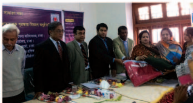
Directors of DBCCI in the CSR program of TB Control and Training Organization Wellbeing Association on January 31, 2015

DBCCI participated in a CSR (Corporate Social Responsibility) program for the TB Control and Training Organization in their Annual General Meeting of the Patient Wellbeing Association. DBCCI donated blankets for the poor patients. The program was held on January 31, 2015 at the Social Welfare Program, Chankharpool, Dhaka.