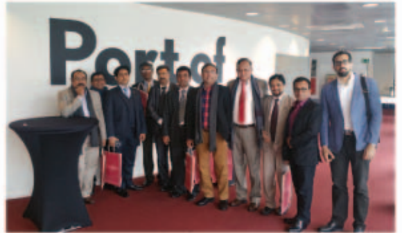
DBCCI Trade Delegation Team in the Antwerp Port in Belgium on 8 September 2015